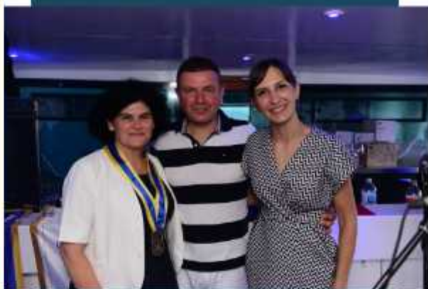
two new members of Rotari club of Kotor received their Rotary pins