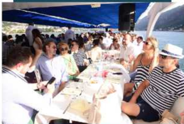
Rotarians enjoying the boat cruise along the Boka Kotorska Bay 2