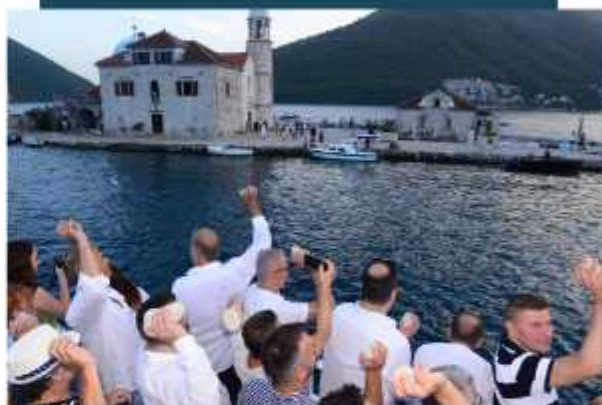
rock throwing for the support of Our lady of the Rock Island