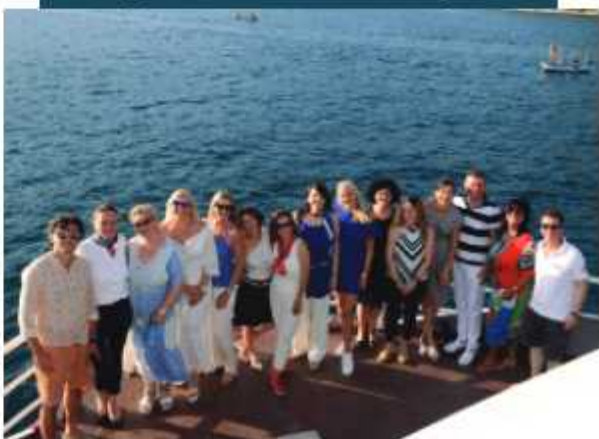
members of Rotary Club of Kotor