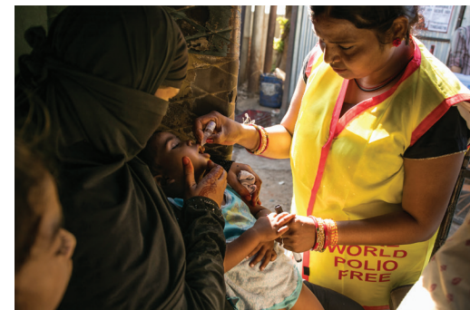
A Rotarian administers the polio vaccine.

Our members’ and others’ contributions to the Foundation allow us to bring sustainable change to communities in need. Ask your club’s Rotary Foundation expert or visit rotary.org/donate to learn how you can support our Foundation. To learn more, download The Rotary Foundation Reference Guide or take the Rotary Foundation Basics course in Rotary’s Learning Center .